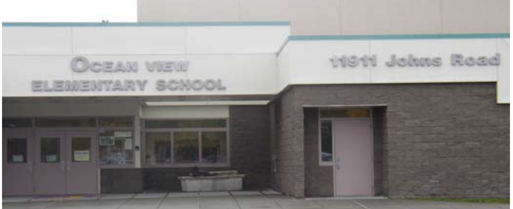
Your Community Council meets at Ocean View Elementary School in the Library. (See schedule above.)