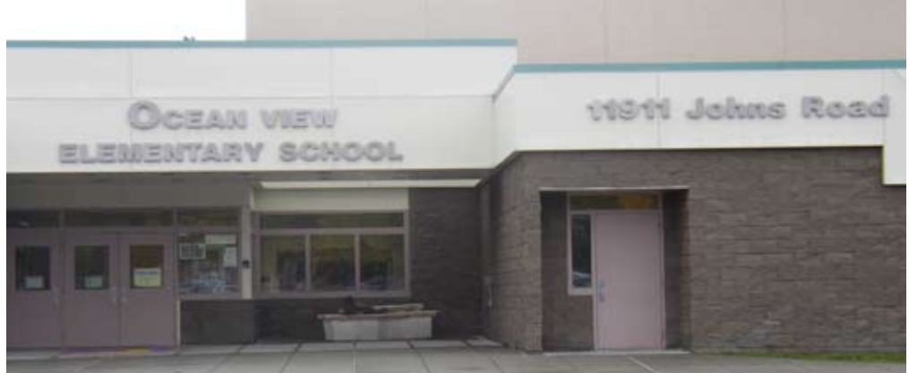
Your Community Council meets at Ocean View Elementary School in the Library. (See schedule above.)