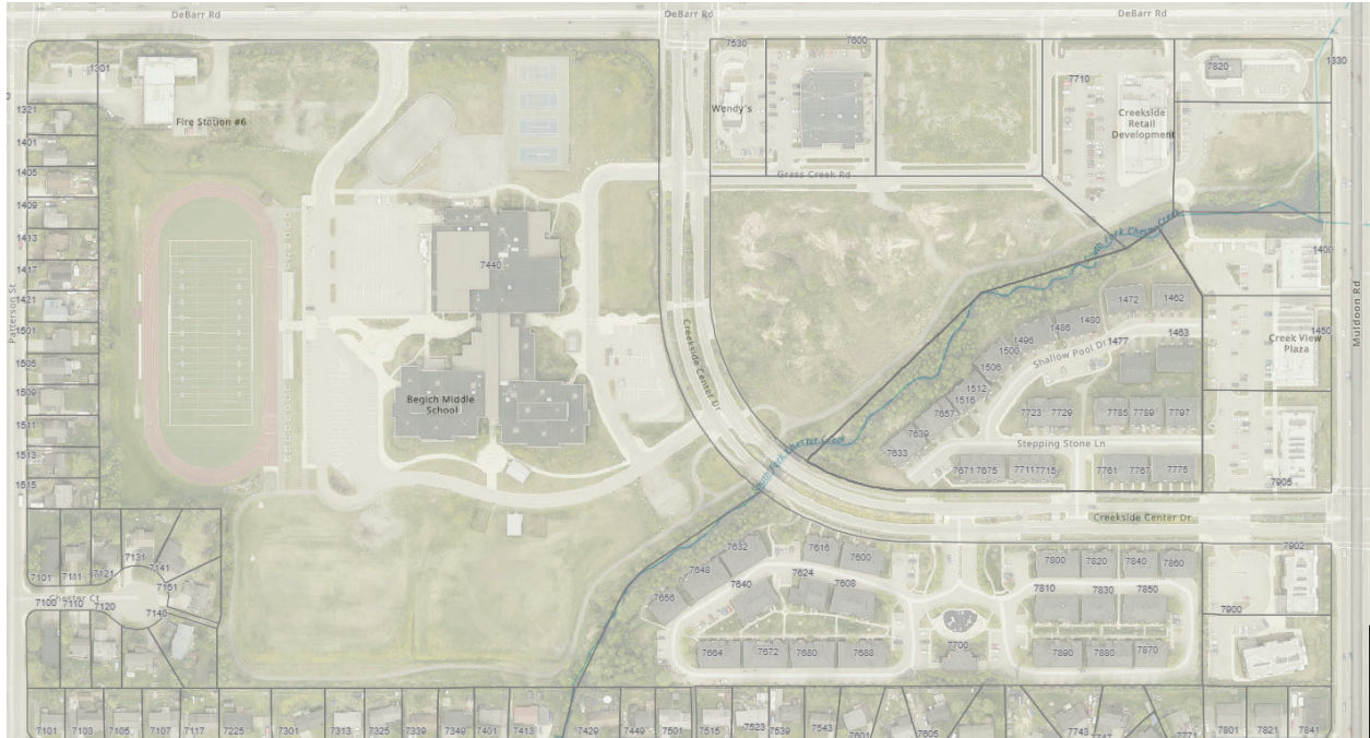
Map of Muldoon Perimeter Line Trail