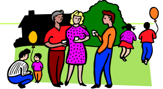
Neighbors celebrating neighbors

is: To call forth from Bear Valley residents, participation enabling them to address local issues and to empower them to communicate about and resolve these issues in an efficient, workable, effective manner.