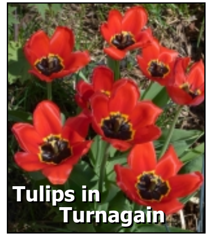
Tulips in Turnagain