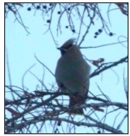
Bohemian Waxwing in Turnagain

TCC Website: http://www.communitycouncils.org/servlet/content/37.html