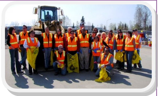
Tons of volunteers make this event possible!

Help Mountain View Shine! Volunteer today!