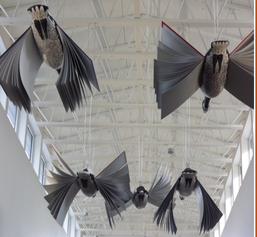
A new species of goose has taken up residence at the Mountain View Library. Stop in to see the new art installments today!

SPOTLIGHTING MOUNTAIN VIEW CELEBRATING AND NE WSLETTER MONTHLY ▼