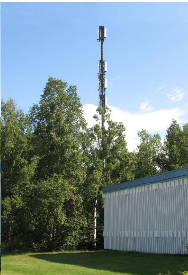
Proposed New Tower