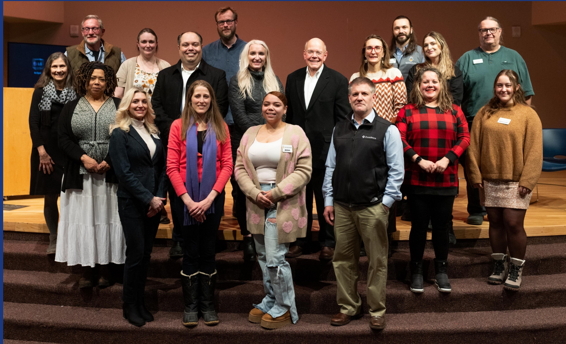
Team members from the Anchorage Coalition to End Homelessness, Municipality of Anchorage leaders and Houston, Texas, visitors gather after a community conversation in December 2023.

Collaboration and partnership can drive down homelessness.