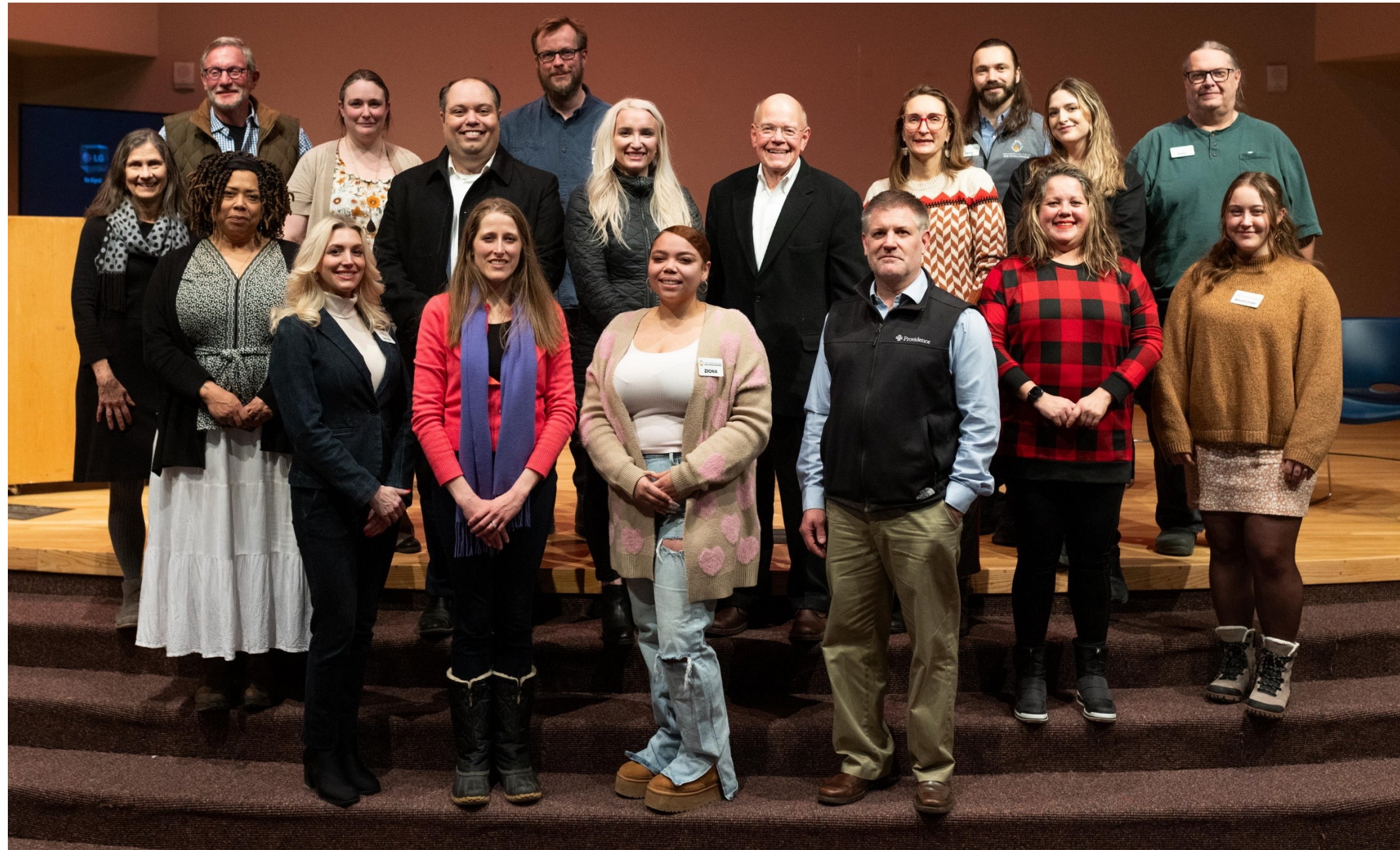
Team members from the Anchorage Coalition to End Homelessness, Municipality of Anchorage leaders and Houston, Texas, visitors gather after a community conversation in December 2023.

Collaboration and partnership can drive down homelessness.