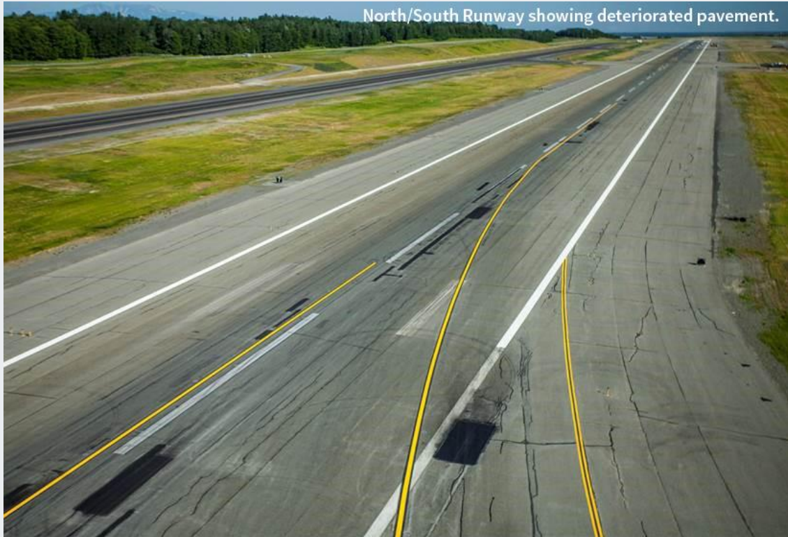
North/South Runway showing deteriorated pavement.

For More Information Please Visit Our Website At