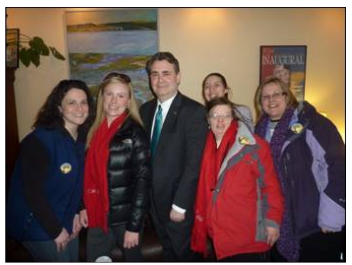
Senator Ellis with Key Campaign constituents.

Through unified, statewide advocacy, the Key Coalition promotes the dignity, status, and equality of all Alaskans who experience disabilities as valued, contributing participants in a shared community. I spoke on the Senate floor (starts at 26:30) about the origins of the Key Campaign. I also had a chance to meet with constituents while they were in town.