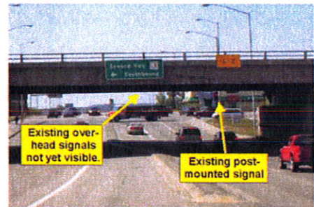
Westbound Approach showing traffic signal display restriction.

Install post-mounted traffic signal here.