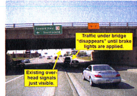
Westbound Approach showing first point where mast arm mounted signals are visible.