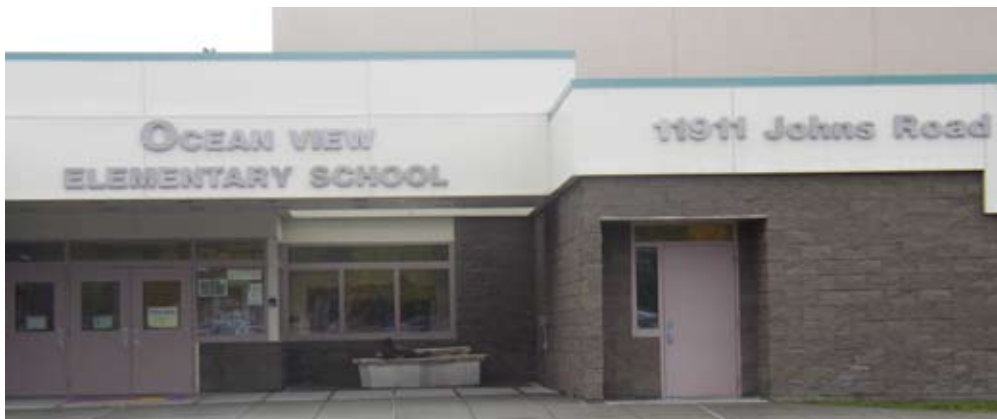
Your Community Council meets at Ocean View Elementary School in the Library. (See schedule above.)

Huffman Construction Road construction for the Huffman business district will begin 2010. By then the Southern part of the Old Seward project should be completed to prevent unbearable traffic conditions for our community. In 2011 Huffman will be completed from New Seward up to Pintail.