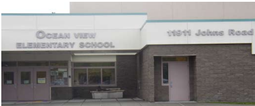
Your Community Council meets at Ocean View Elementary School in the Library. (See schedule above.)

Word on the street is that some of the stimulus money is going to Huffman Road from Old Seward to Pintail. We can only hope all remember the folks who live in the area do not wish the Old Seward from O'Malley to Brandon project and Huffman project to happen at the same time, both are our busiest business district streets.