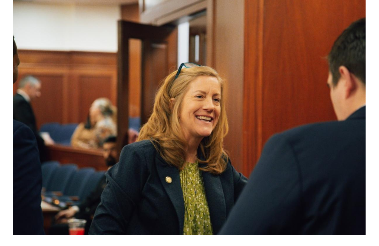
I had many productive conversations with my colleagues on the House Floor this session.