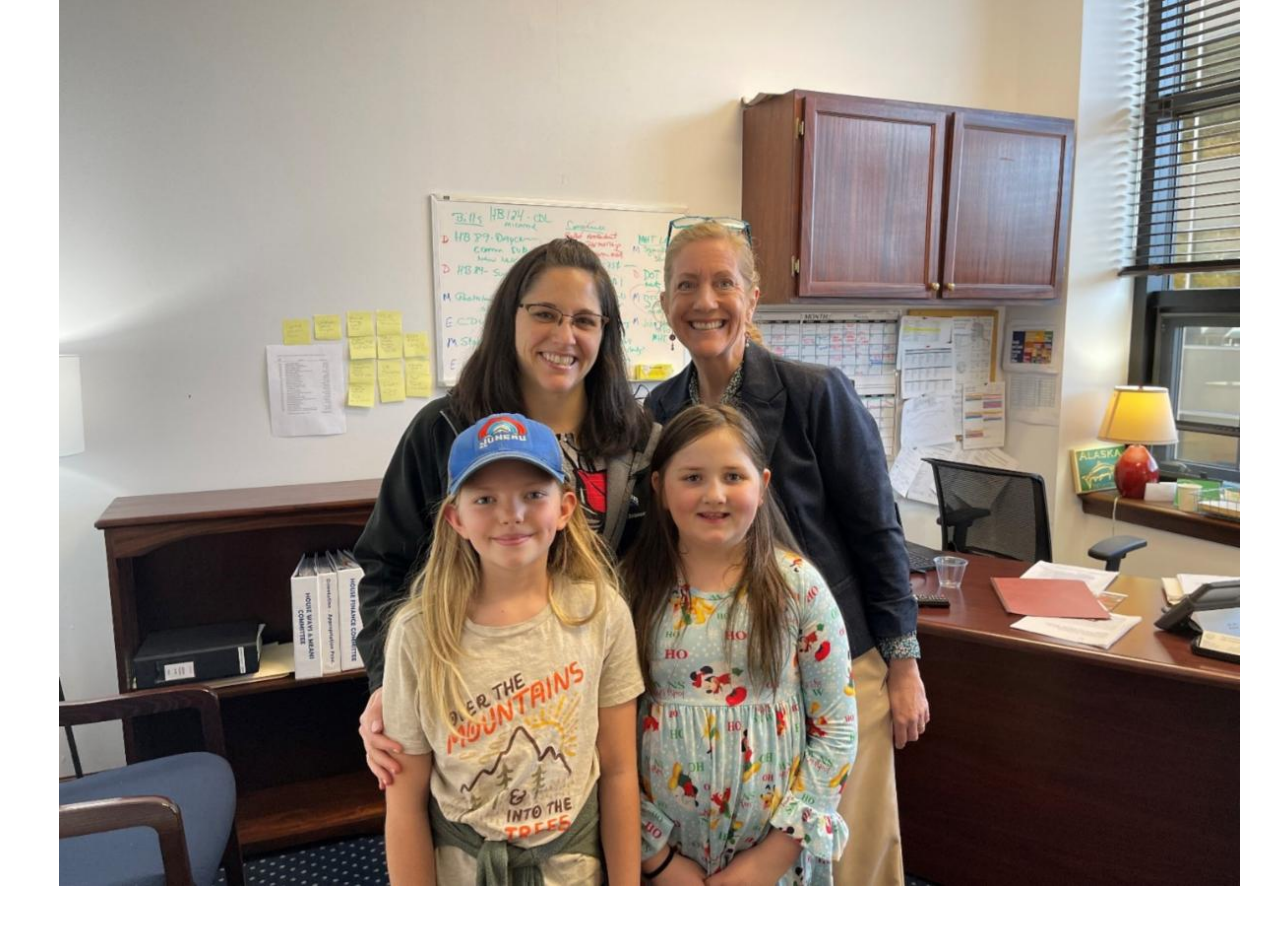
I had an impromptu meeting with a mother and her daughters. I am always looking for ways to help families.