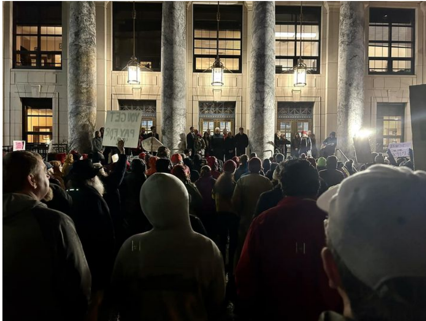
Rep. Schrage joins legislators, parents, students, and educators for an education rally at the Capitol Steps. Jan. 23rd, 2023

want the legislature to ensure Alaska's schools have the resources needed to provide a quality education and to address our poor teacher recruitment and retention. Our caucus has made clear that increasing the Base Student Allocation (BSA) and providing our educators and public employees a competitive retirement plan are a top priority and we are determined to fight for Alaska's students, families, and educators.