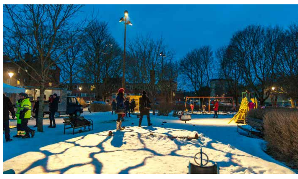
Projected lighting could achieve various surface patterns