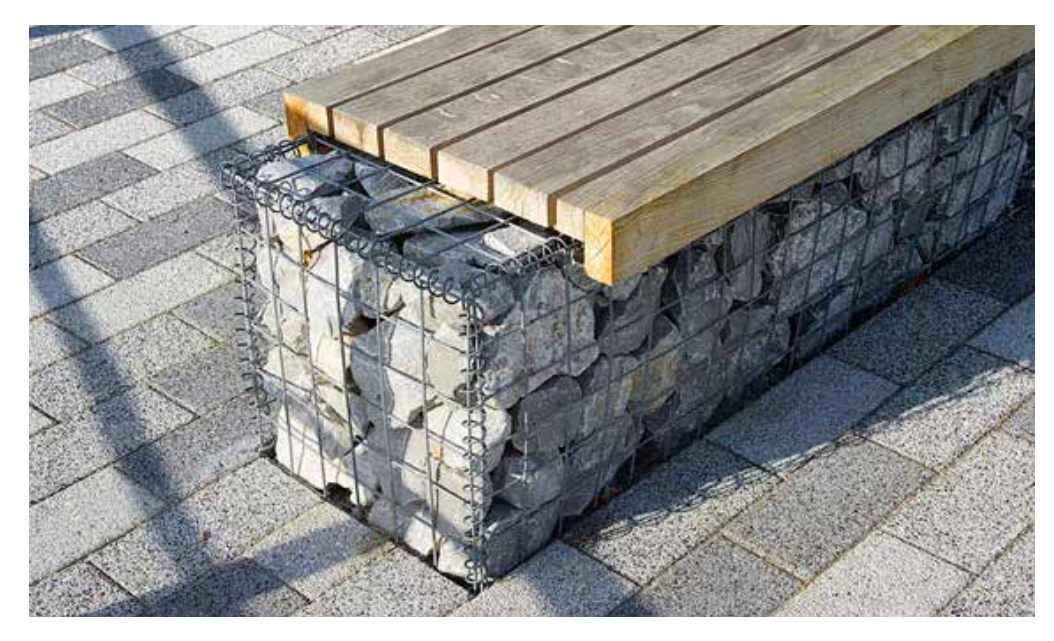
Gabion wall with wood top for seating