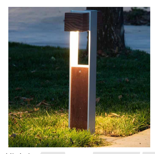
Low bollard lighting