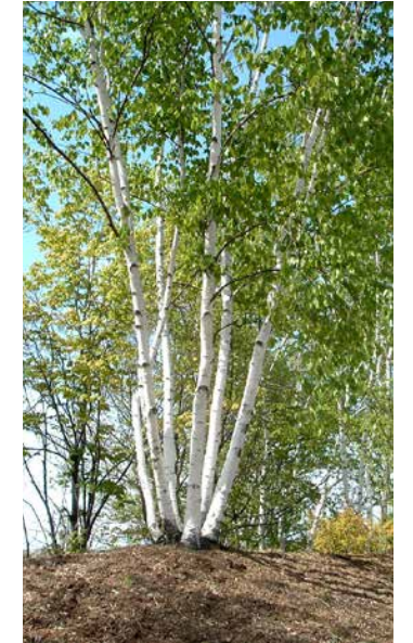
Native Trees - Birch, Larch