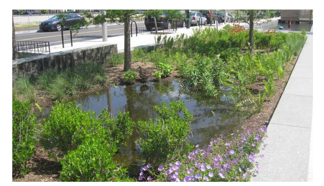
Raingarden with native perennials