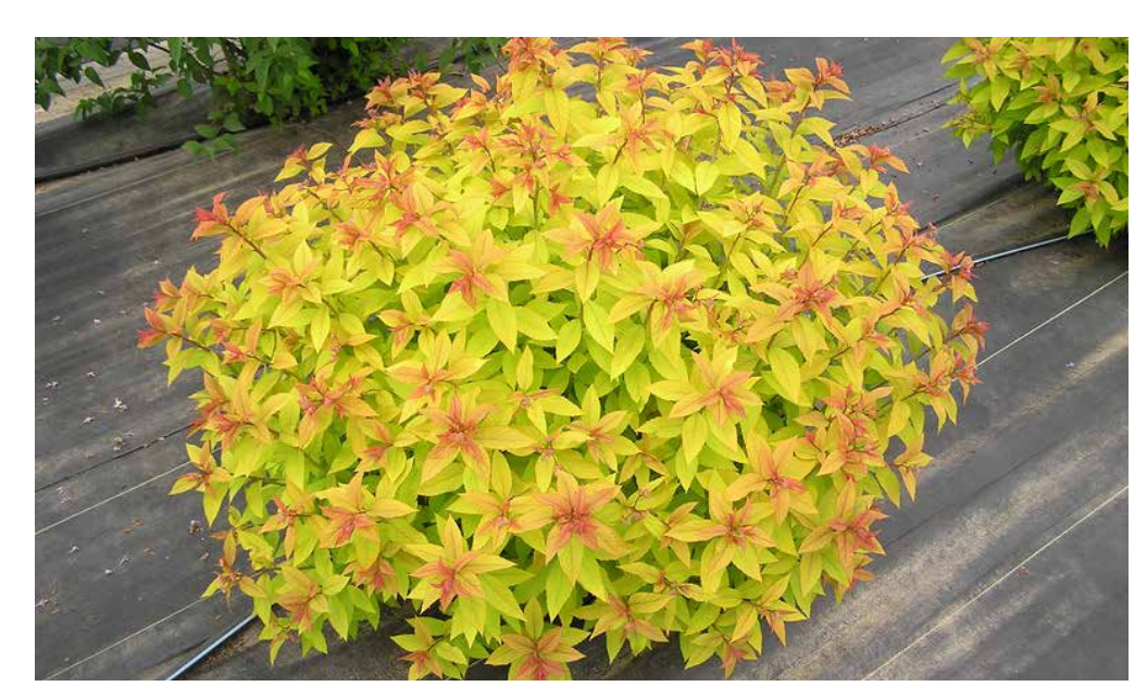
Low Shrubs - Spiraea (low maintenance)