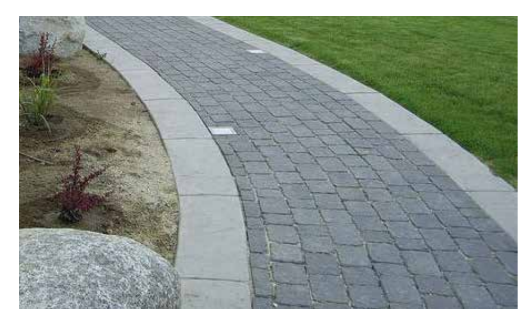
Stone pavers with concrete boarder