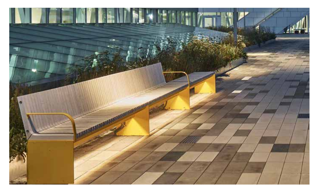
Benches with integrated lighting