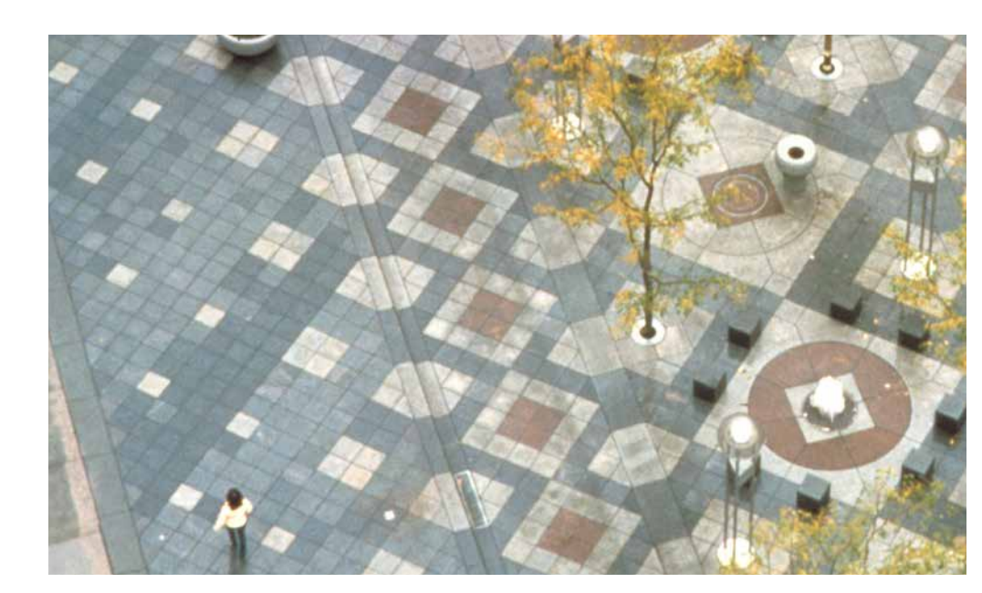
Single shape with different colors forming patterns