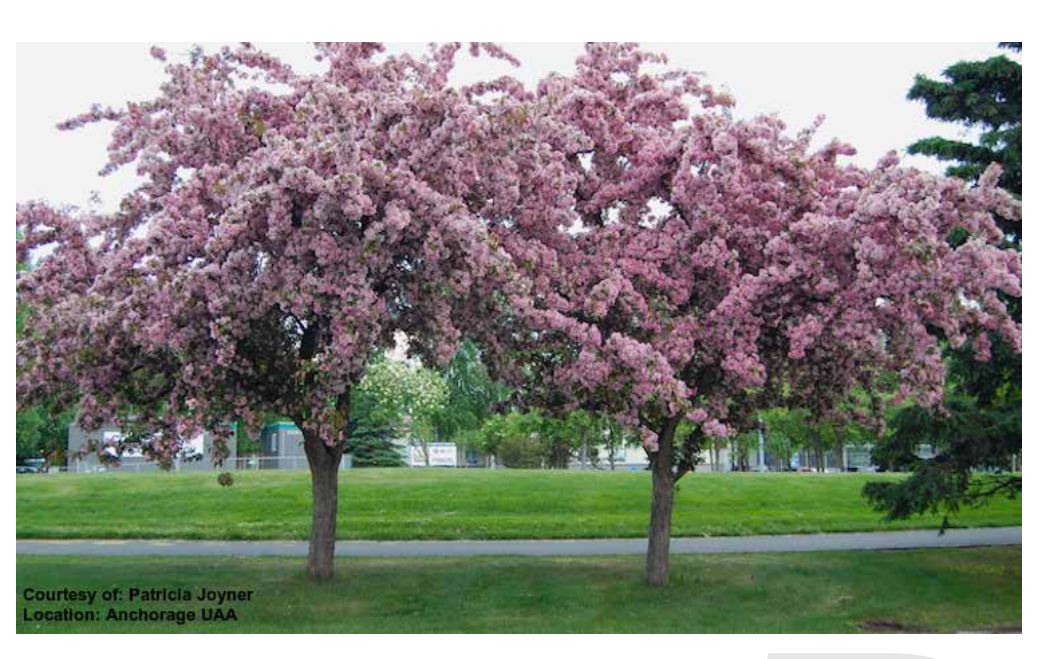
Ornamental Trees - Crabapple