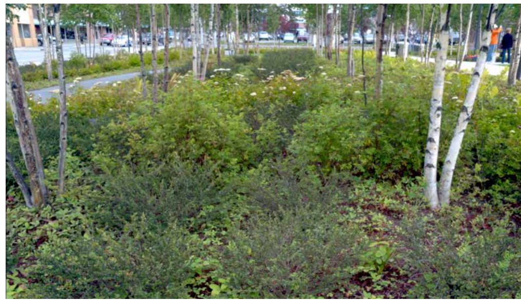
ANC Museum style with native plants