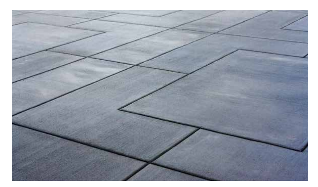
Scoring forming patterns