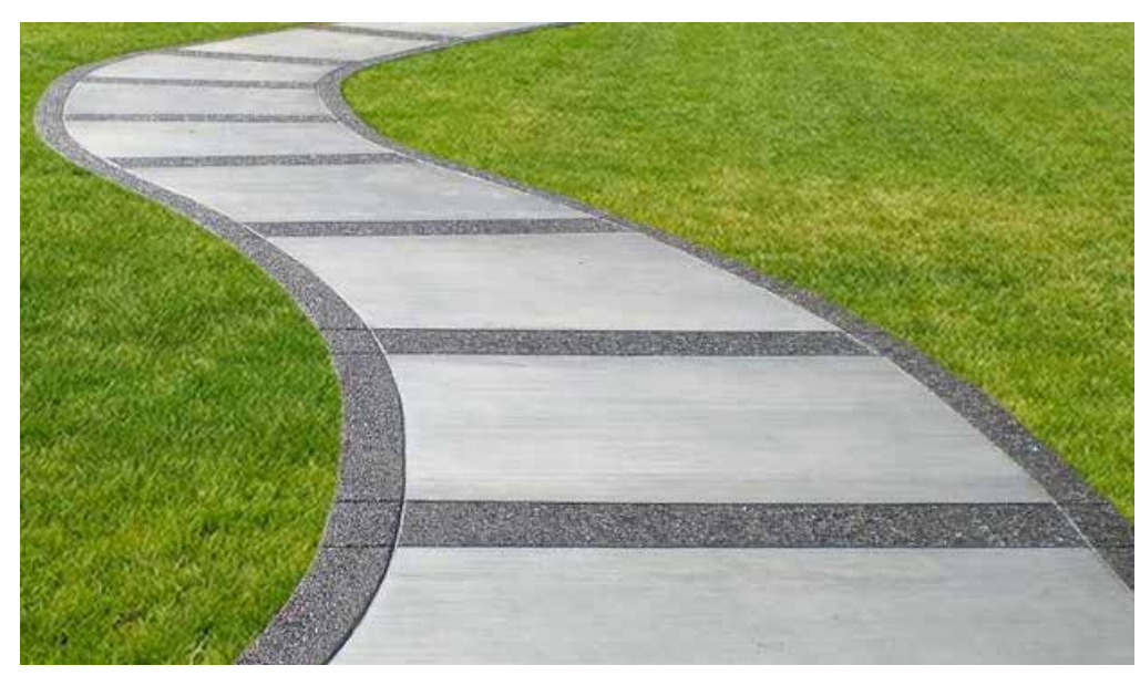
Exposed aggregate bands