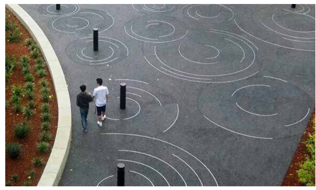
Inlays forming patterns