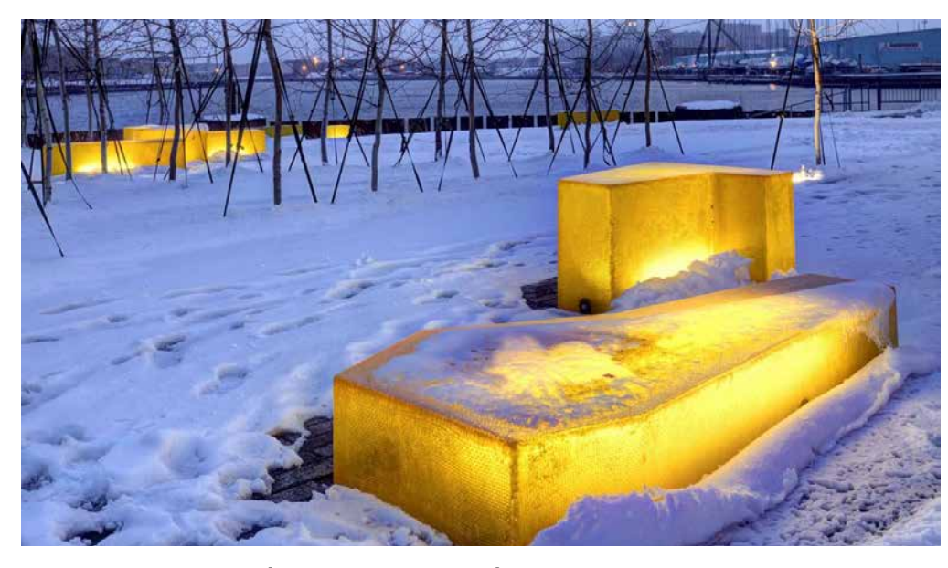
Entire bench lit (winter interest)