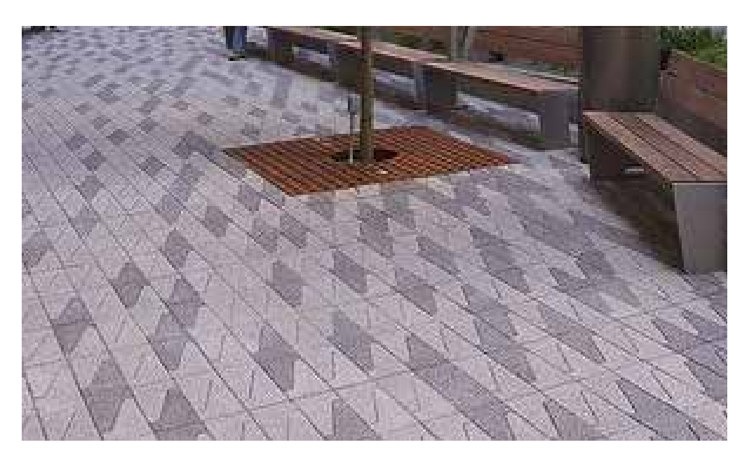
Various shapes forming the pattern