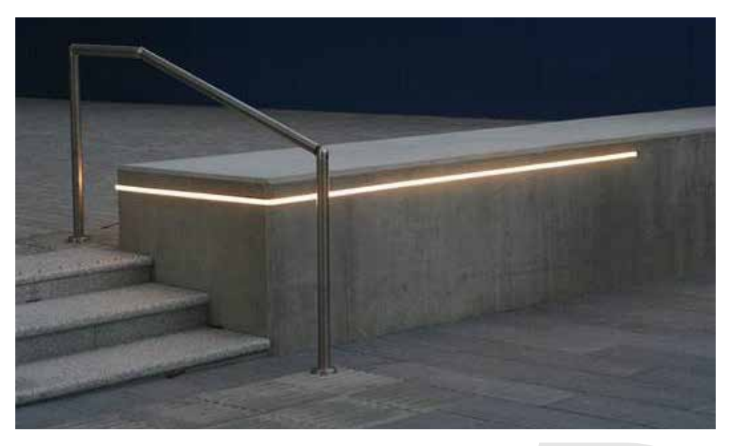
Concrete with integrated lighting