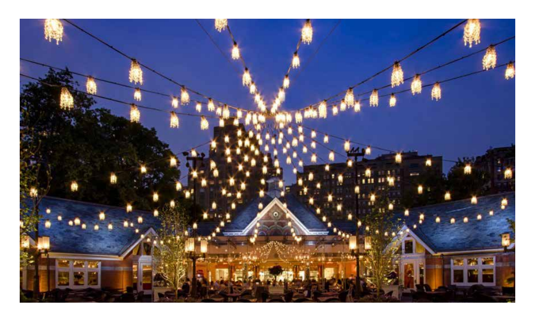
Holiday or Catenary Lighting