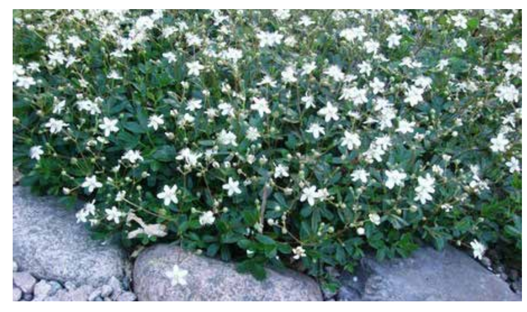
Low Shrubs and Groundcovers - 'Nuuk' Potentilla