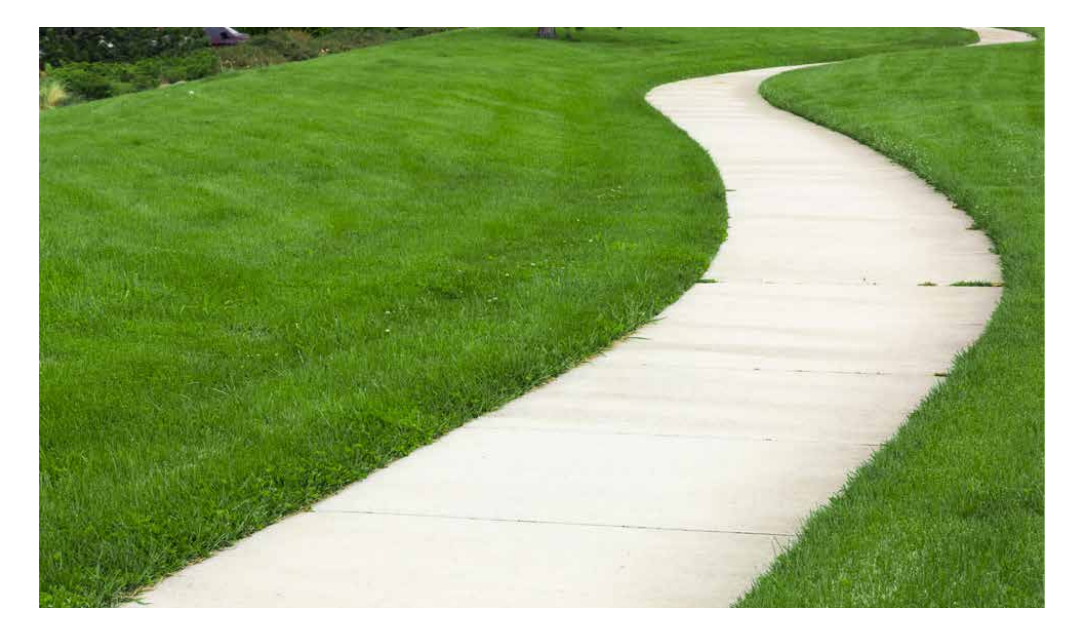
Upgrade asphalt to concrete