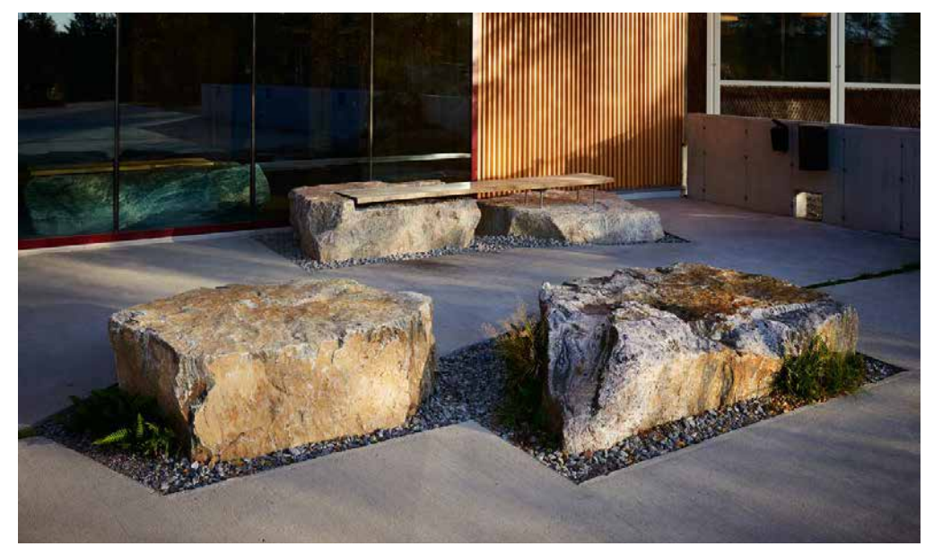
Boulder/rock seating integrated in paving