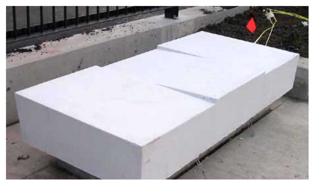
CPTED designed furnishings and site features