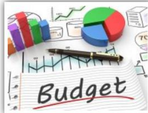
January 15th, 2021 Fiscal Policy Study Group