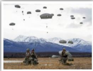
January 20th: The Military and Coast Guard in Alaska

Click here to receive announcements about upcoming events and study groups.