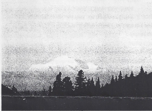
McKinley seen from Sun Valley Drive, January 2000

South Fork Volunteer Fire Department is looking for volunteers. They offer training every Tuesday, and lots of good camaraderie. And that good feeling of doing something worthwhile. They meet at the firestation on Tuesday evenings. You see the cars there. Show up and find out how it feels to be