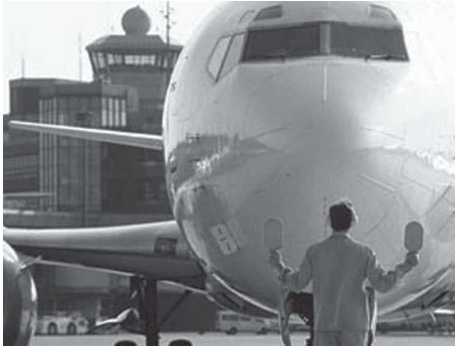
AIRPORT EXPANSION... COME HEAR WHAT'S HAPPENING, AND HOW IT EFFECTS YOU.

YOUR NEXT COMMUNITY MEETING IS COMING MONDAY 4/13/09