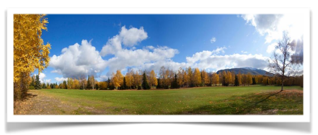
Sept 6, 2018 Meet and Greet potluck Report