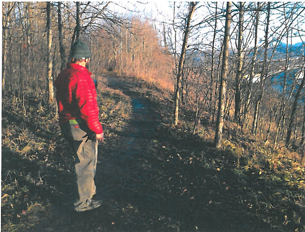
Will be similar to this trail on the South Bluff