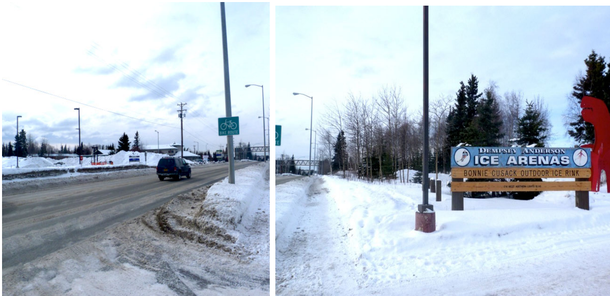
Above & next page: Existing naturally-treed aesthetic visual buffer along WNL south of Dempsey Anderson Ice Arena and Bonnie Cusack Outdoor Ice Rink facilities and parking lot.