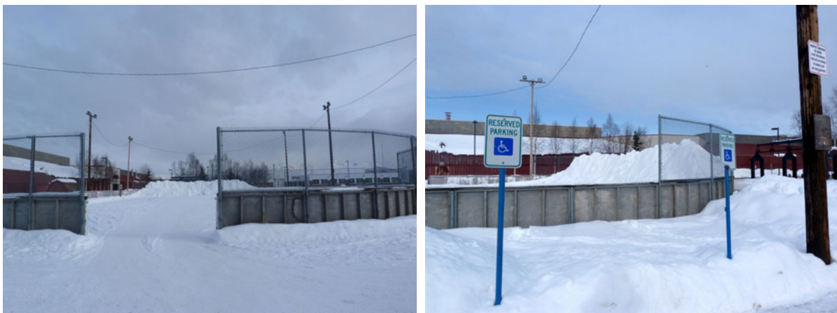
Below: Current Snow Storage in Bonnie Cusack Ice Rink directly south of Dempsey Anderson Ice Arena