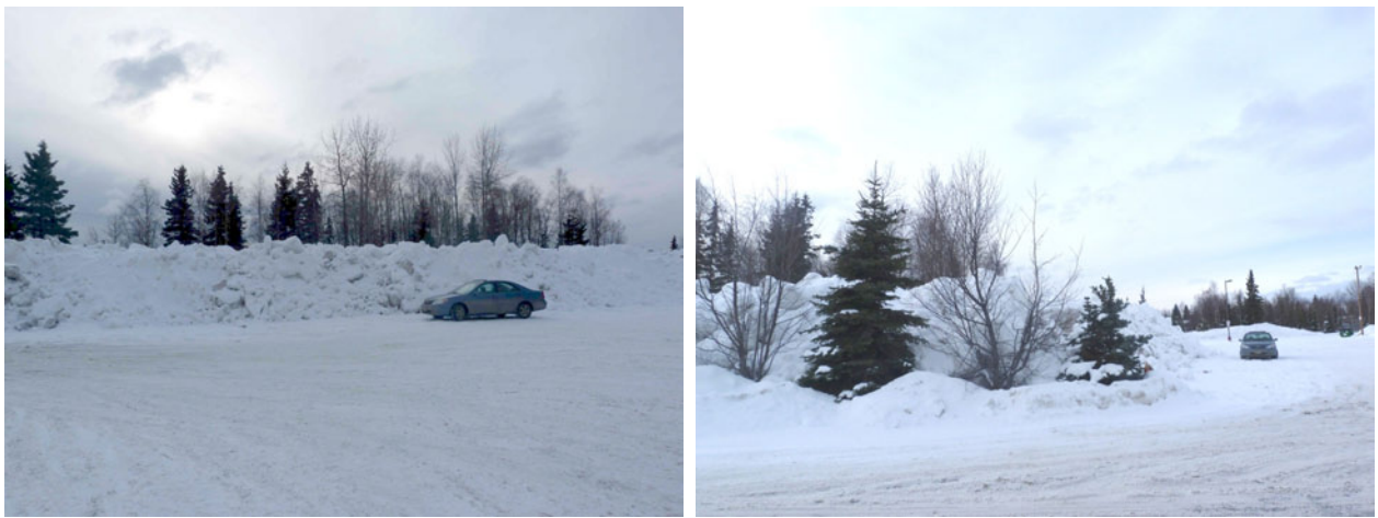
Above: Current Snow Storage at Dempsey Anderson Ice Arena southern area of parking lot.

Based on the current design plans that would eliminate the outdoor ice rink and a significant portion of the parking area currently used for snow storage, snow storage impacts, including the costs associated to haul snow off-site, need to be addressed.