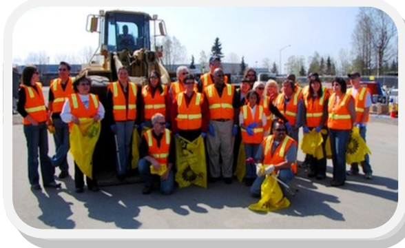
Tons of volunteers make this event possible!

The Annual Mountain View Community Clean Up will be held from May 12-May 19 at the Brewster's location . How can you help this year? The community needs reliable people who are willing to learn the rules of the CleanUp lot, man the lot, help pick up large items, clean up streets during the week, etc. If you or someone you know could help in any way, please contact Niki Burrows at nburrows@alaska.net or 274-1179.