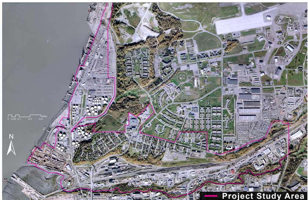
Project Study Area