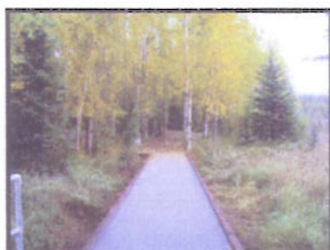
An example of the type/look of boardwalk to be used in this project (Overlook in Baxter Bog Park)