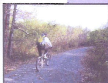
An example of the gravel trail type to be used in this project (Trail of Blue Ice at Portage)