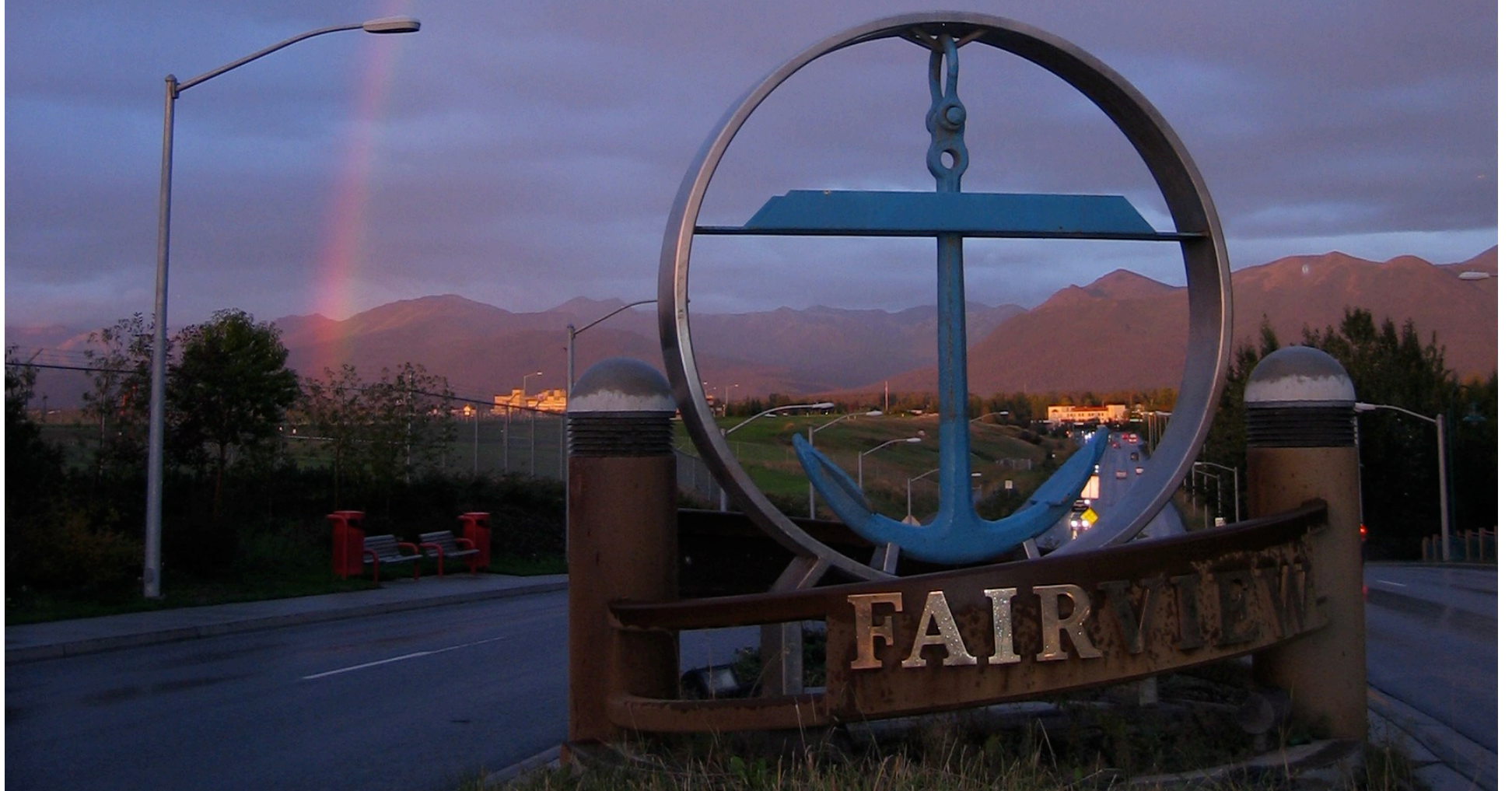
Fairview Community Council Business Areas Land Use - 2006