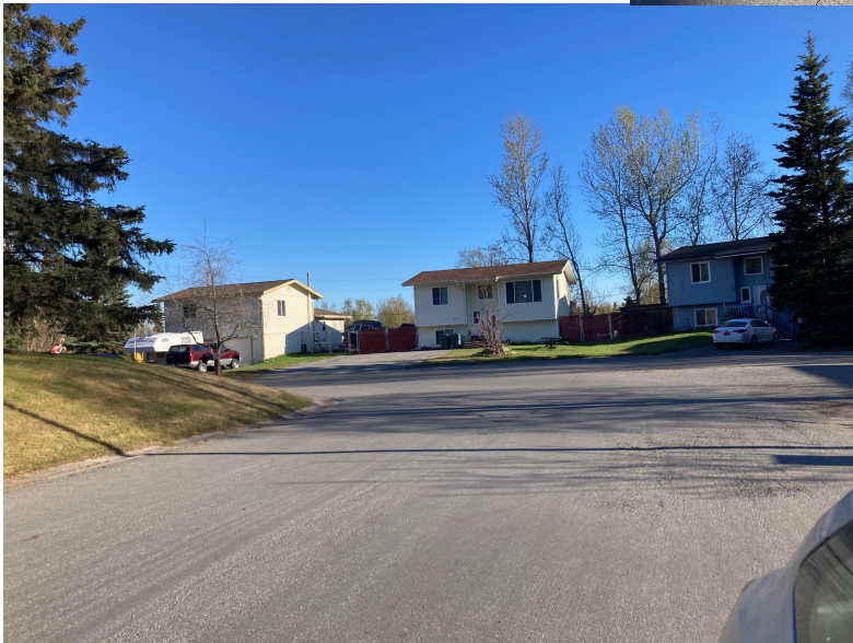
Figure 4: East Henderson Loop, looking north. Road bends to the west around a blind curve. In winter, the snow mountain in the cul-de-sac reduces this to a single lane.