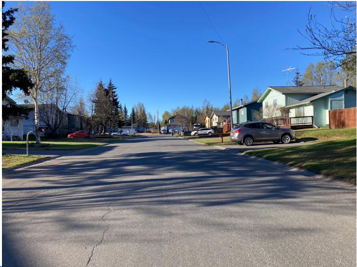
Figure 3: East Henderson loop, looking south. No sidewalks present, numerous driveways exit directly to street.