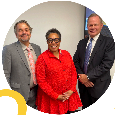
2 Increasing Housing Supply and Addressing Homelessness