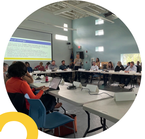
3 Supporting Mental & Behavioral Health Needs

The Municipality has invested considerable time and resources into each of these areas – securing valuable federal grants for the Port, using federal recovery funds and alcohol tax proceeds to create new housing and behavioral health services, and amending code to make it easier to build housing in Anchorage.