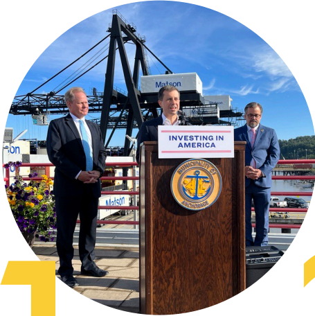
1 The Port of Alaska Modernization Program

There are three top priorities for the 2024 Legislative Session: