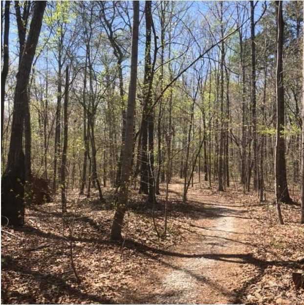
Trail at Ramsey Creek Preserve