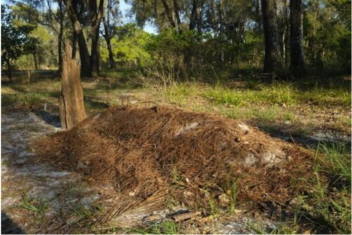
Natural burial at Prairie Creek Conservation Cemetery