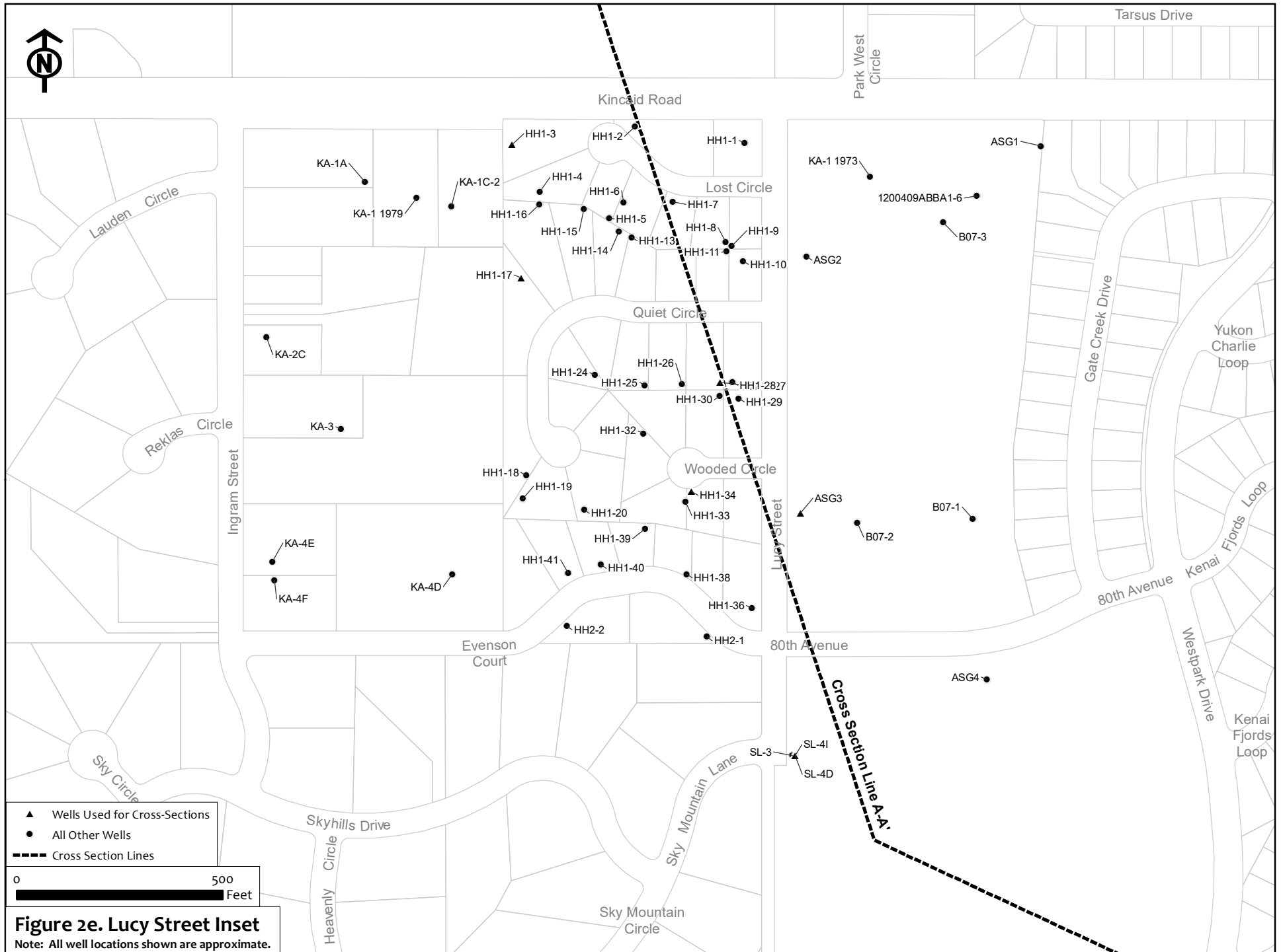
Figure 2e. Lucy Street Inset

Note: All well locations shown are approximate.