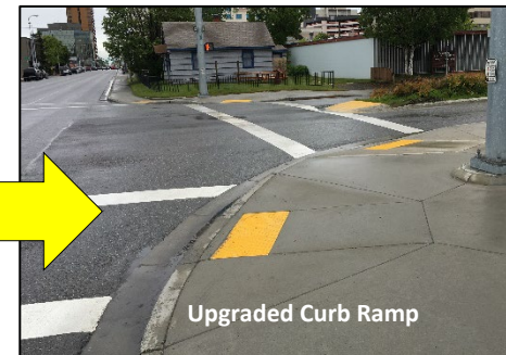
Upgraded Curb Ramp