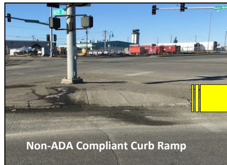
Non-ADA Compliant Curb Ramp