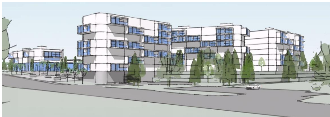
View from Dimond Boulevard