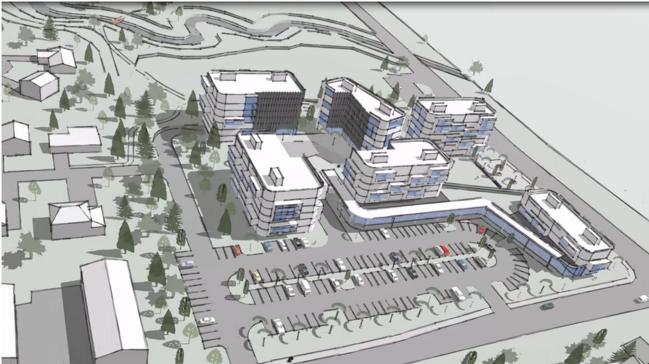
View from Arlene St towards Dimond Blvd and Campbell Creek